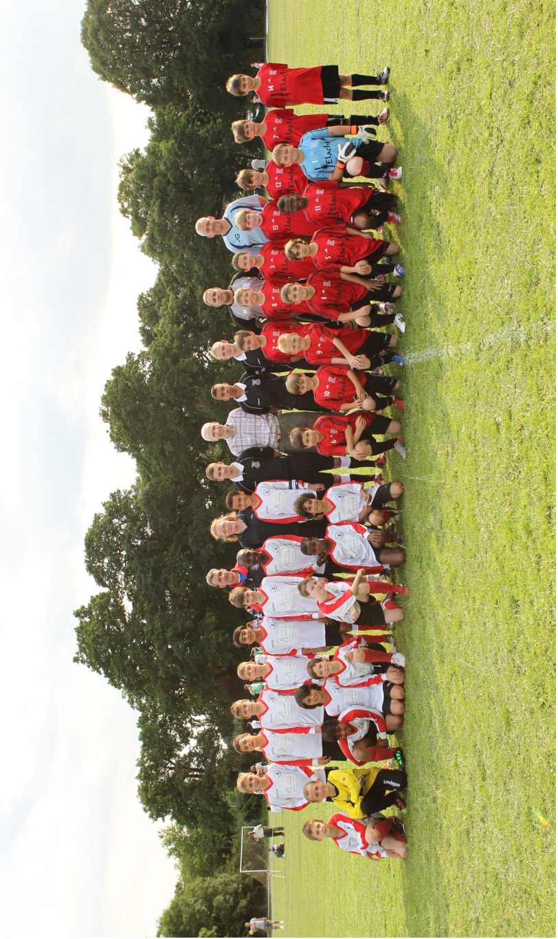
Harrow Youth Football League: National FA Charter Standard League of the Year (FA Community Awards)